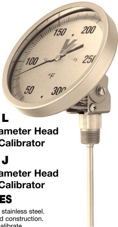
Model L 3" Diameter Head with Calibrator